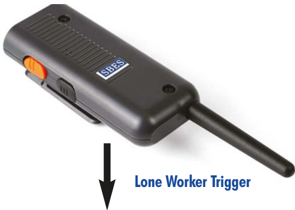
Lone Worker Trigger