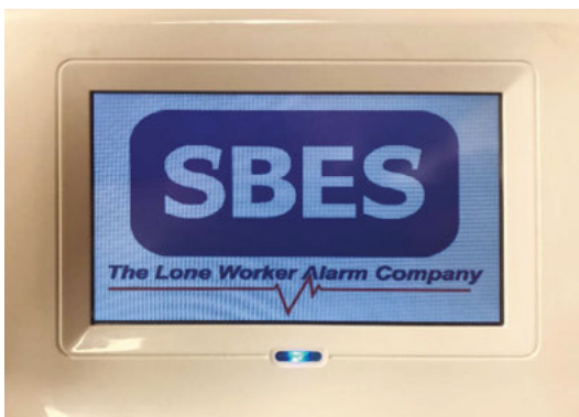
Control Panel Display