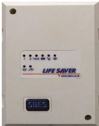
Receiver (for Structured Cabling System)